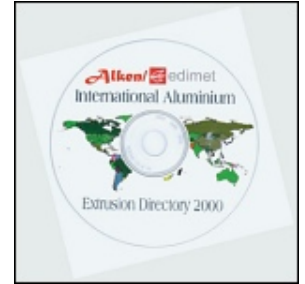
World directory of Extrusion - Standar Version